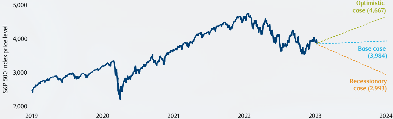
Wide range of potential outcomes for U.S. markets

Data from January 1, 2019 to December 15, 2022. Last price: 3,896. Outcomes based on different price to earnings and earnings per share projections.